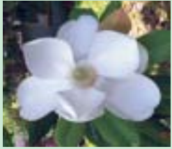
Our 35th Year