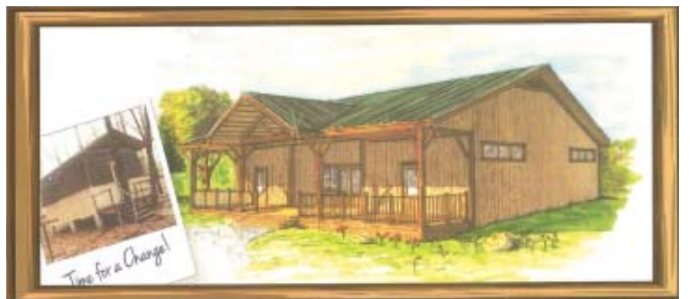
New Cabins to Replace the Old at Sardis Lake Christian Camp