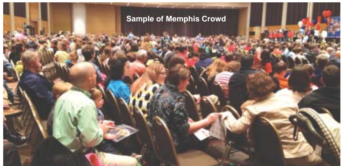
Sample of Memphis Crowd