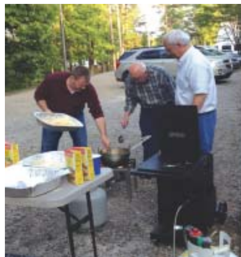
Thanks to All VOLUNTEERS Who Helped. (A few of many pictured above)