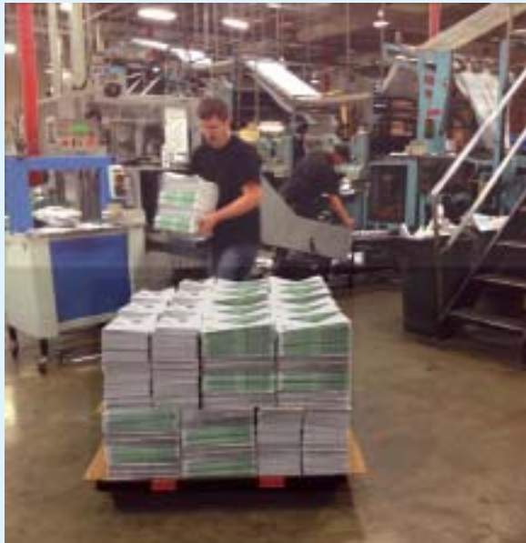
Worker stacks freshly printed copies of the Magnolia Messenger as they come off the presses in Hattiesburg, Mississippi