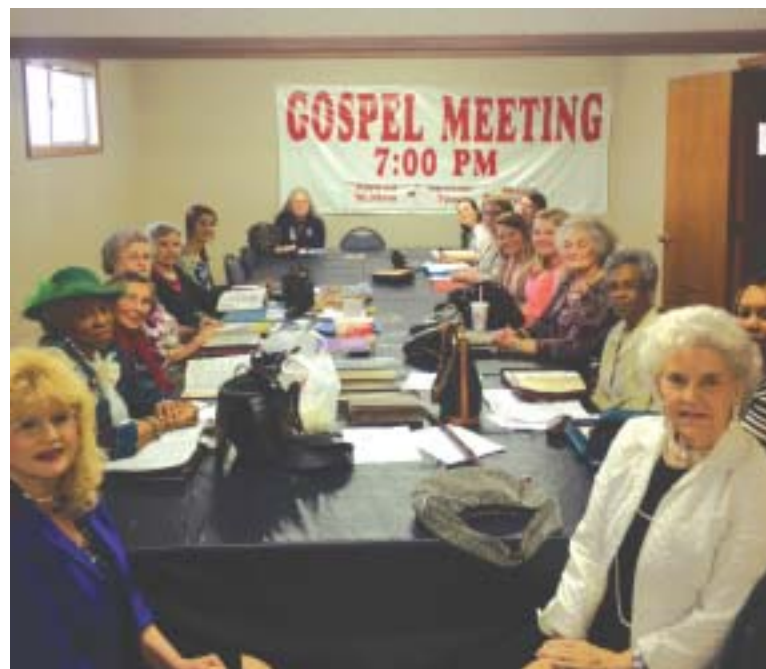
Ladies Class in Yazoo City Pauses for a "Picture Break"

of the service he encouraged some of the young people to stand before the church and help him with a song. We really enjoyed our visit with this church family.