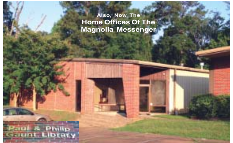
Also, Now The Home Offices Of The Magnolia Messenger

More than 30,000 Books Available to Bible Students (See Page 16)