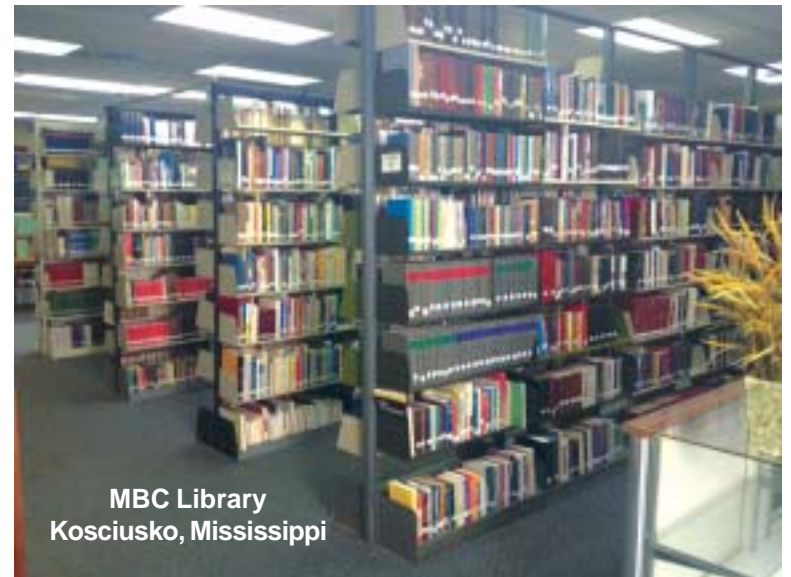
MBC Library Kosciusko, Mississippi

A partial view of the more than 30,000 volumes To be made available to students of God's Word