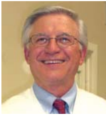
Preacher for the Lake Harbour Church in Ridgeland