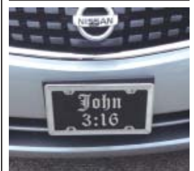
Powerful Passage Looks Good Anywhere! Even on a Nissan