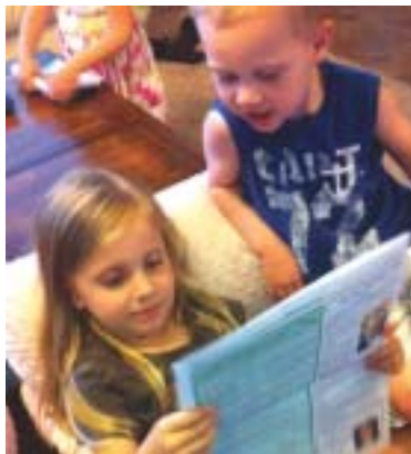
Kids Caught "Reading" the MM